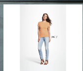
REGENT WOMEN 01825